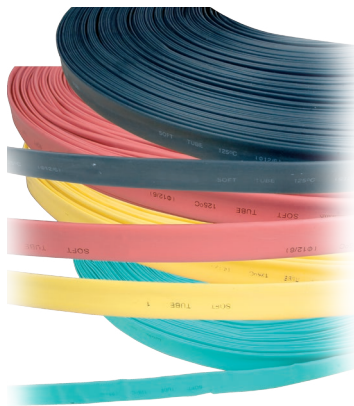
Standard: EN 60 684